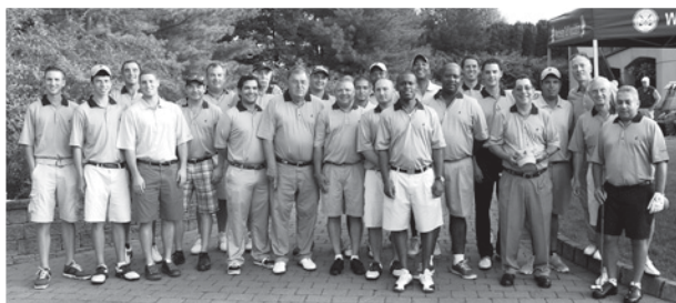
2012 Golf Marathon participants